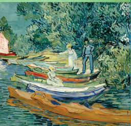
3 Refuge Gateway, Fishing Pier Info Kiosk 5437 W Jefferson Ave Bank of the Oise at Auvers, Vincent Van Gogh