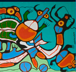
2 Refuge Gateway, Main Parking Lot Info Kiosk 5437 W Jefferson Ave Cycles, Norval Morrisseau