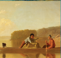
4 Refuge Gateway, Kayak Launch 5437 W Jefferson Ave Trapper's Return, George Caleb Bingham